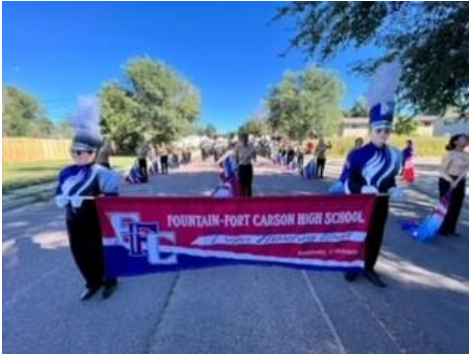
The Trojan Marching Band at the Fountain Fall Festival Parade!