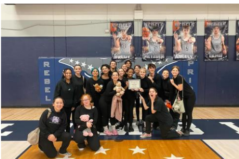
Congratulations to the FFCHS Winter Guard for winning 1 st place in class SAA at Columbine High School on February 10 th !

We rely on fundraising to cover the cost of registration fees for all aspects of the program (concert band, jazz band, winter groups, etc.) honor band participation fees, food, reeds, trips, and equipment. Please help us by spreading the word about our fundraiser!