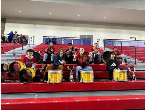
The FFCHS drumline playing at the first basketball pep band game in the new arena!