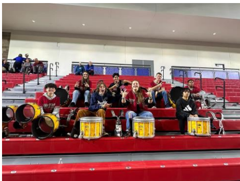
The FFCHS drumline playing at the first basketball pep band game in the new arena!