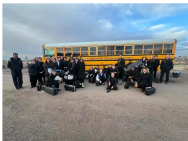
Congratulations to both the Crimson and Royal Jazz Bands for receiving a superior rating at the Steel City Jazz Fest!