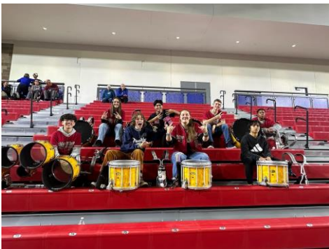
The FFCHS drumline playing at the first basketball pep band game in the new arena!