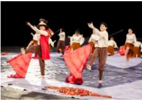
Congratulations to the FFCHS Winter Guard on earning 2 nd Place at the RMCGA State Championships in Class SRA!