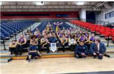
Congratulations to the FFCHS Indoor Percussion for earning 5 th Place at the RMPA State Championships!

The band will perform for Band Day at the bandshell in the fair grounds that same afternoon.