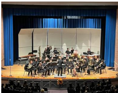
Congratulations to all our concert bands on an amazing concert last month!

There will be a meeting for all volunteers on Tuesday, October 10 th .