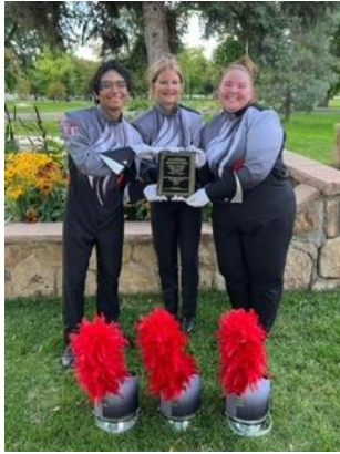
Congratulations to the FFCHS Marching Band on earning 1 st place at the Colorado West Marching Invitational.