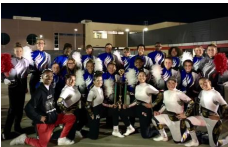
Marching Band Seniors – Class of 2020!

Students should also submit the $40.00 participation fee, and will receive a refund of the fee if they are not selected to participate.