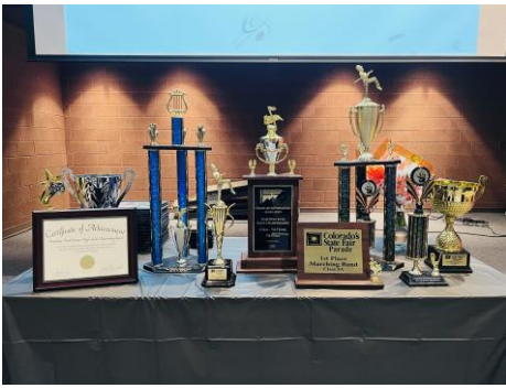
Trojan Marching Band 2021 trophies from the season!