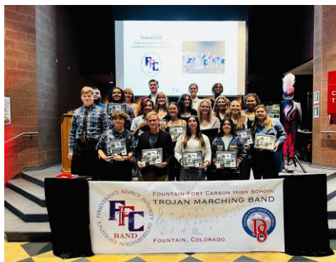
1 Class of 2022 Marching Band Seniors at the Marching Band Banquet!

Check the band website for more information!