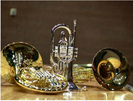
Some of our new instruments the district purchased!